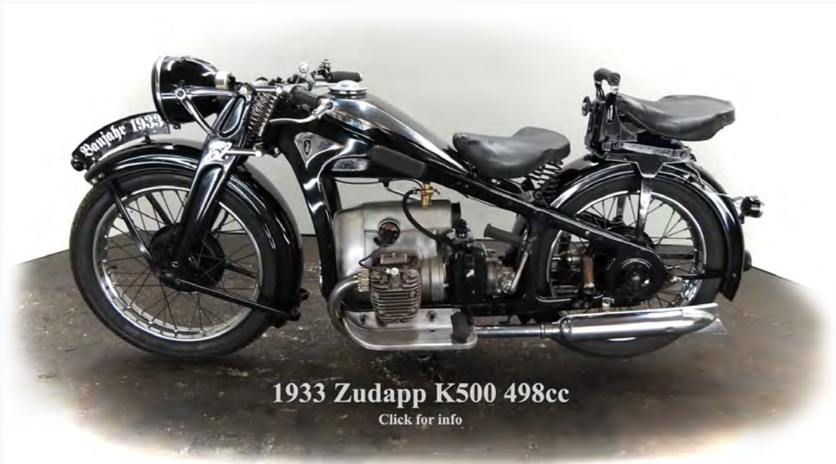
1933 Zudapp K500 498cc