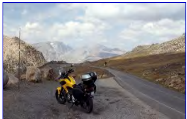
Sitting at 9,000' on the top of the Beartooth Highway between Yellowstone and Red Lodge.

Did someone say Beartooth Highway? Just northeast of the park is the Beartooth Highway, a wonderful delight. If the weather is just right it is awesome to ride. If you plan to ride to Yellowstone, add in an extra day to go to lunch at Red Lodge and return that night, or add it as a one-way trip on your way in or out.