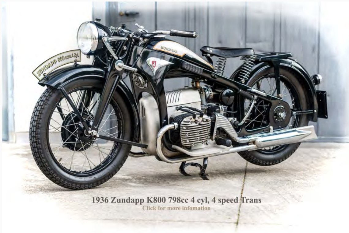
1936 Zundapp K800 798cc 4 cyl, 4 speed Trans Click for more information

Oyster Run - Motorcycle Run - Anacortes WA