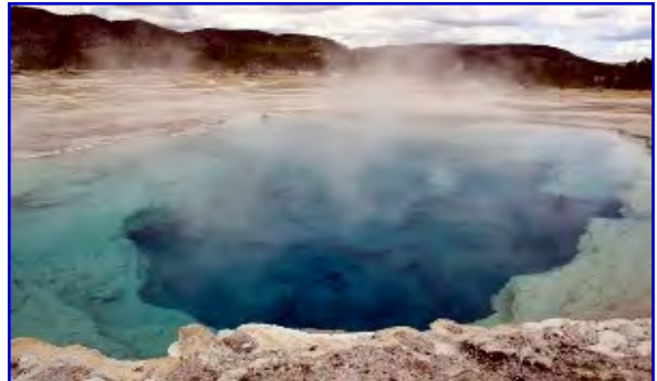
There are all types of hydro-thermal pools to be viewed ranging from this pristine deep blue spectacle to the various mud and oxide colored pools.

Did someone say thunderstorms? Like so many National Parks, Yellowstone has the ability to create its own weather. If you're camping, be sure to secure your tent for a gale before taking a day ride around the park. If it's 100 degrees when you leave home, do not use that as an excuse to leave your rain gear at home. Pack your rain gear no matter what.