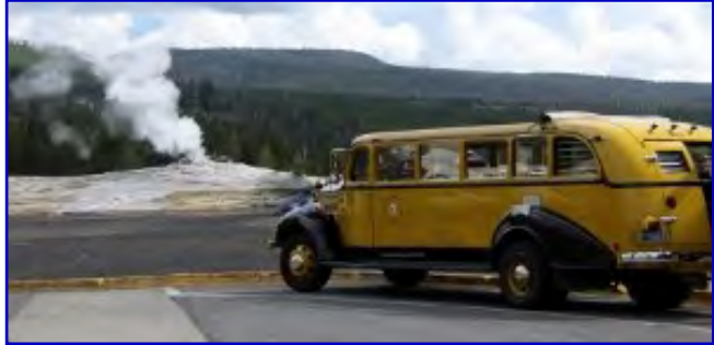
The Yellow Bus tours pack 13 passengers into a 1930s White Freightliner bus and provides a relaxing tour of the park daily during the warmer months. Old Faithful burbles in the distance.

Road Quality - With a typical elevation above 6,000 feet, Yellowstone roads are actually some of the best in the world. The reason is because it's a national park, so don't feel too bad when they wank you for $20 plus at the gate. Part of that goes to road maintenance which is top grade. But it also means you're going to come upon sections that are under repair. Relax, get off the bike and enjoy the surroundings while you wait your turn to move again. They typically don't have more than one or two sections under repair at any given time.