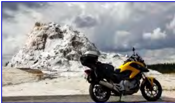
Pullouts get up close and personal with much of the geo thermal formations.

For starters, there's the pullouts. There's a lot to see. Might be bison, might be a geyser or it might just be wolfing down a bison dog in Canyon Village. If you think you'll just blast through in a day or less on your next trip to Sturgis, you'll miss a lot.