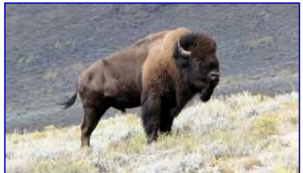
Bison along the side of the road are common. Mind your own business and they won't mind you. Get too close and you may be gored, even if you're riding.

Accommodations. Not easy in the summer, but things open up after Labor Day, temps are cooler and the park moves into autumn mode, so you may enjoy some time here later in the year, even if you're on the bike. Your choices are indoor lodging, or camping at reasonable rates having your bike within a few feet of your tent on the pavement.