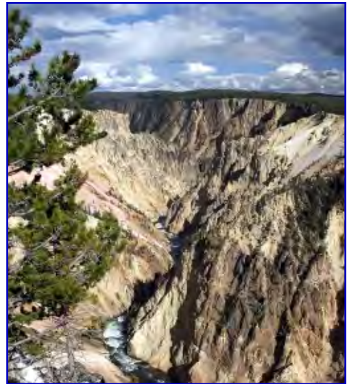
The Grand Viewpoint in late afternoon really lets the walls of the canyon light up! So this is why they call it Yellowstone...

There are several things to know about riding a motorcycle here. Whatever kind of traveling you're doing that brings you to the park, you should allocate at least a day or two in the park to explore its many wonders. Unlike smaller national parks like the North Cascades, you can't blow through or you'll miss much of what the park is about.