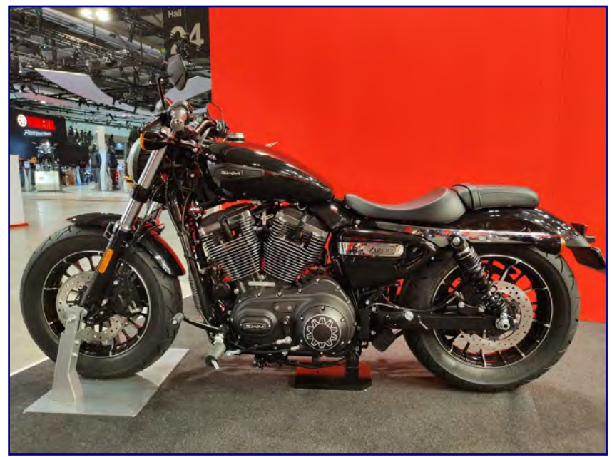
When is a Sportster not a Sportster? When it's an SWM Stormbreaker.

4th: Goes to the manufacturer Moxiao, which is producing numerous clones of Ducati's and BMWs in China.