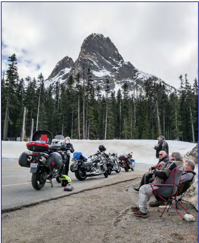
May 15, 2020 - North Cascade Highway opening. Lunch at Washington Pass.

Anyone who wants to ride over Stevens Pass, we can meet at <u>Alta Lake State Park</u>, Pateros, WA. We will be camping here the night before SR20 opens. The following morning, we'll ride to the pastry shop in Twisp, for coffee and goodies. Then, we'll continue west on SR20 toward the east gate at Early Winters (<u>Milepost 177</u>) to hopefully arrive about 10am. Traditionally, the east and west gates open simultaneously. From the east gate, we'll continue west to Washington Pass for a pit stop and more coffee. I'm aiming to be here for a little bit, hoping between 12-1pm.