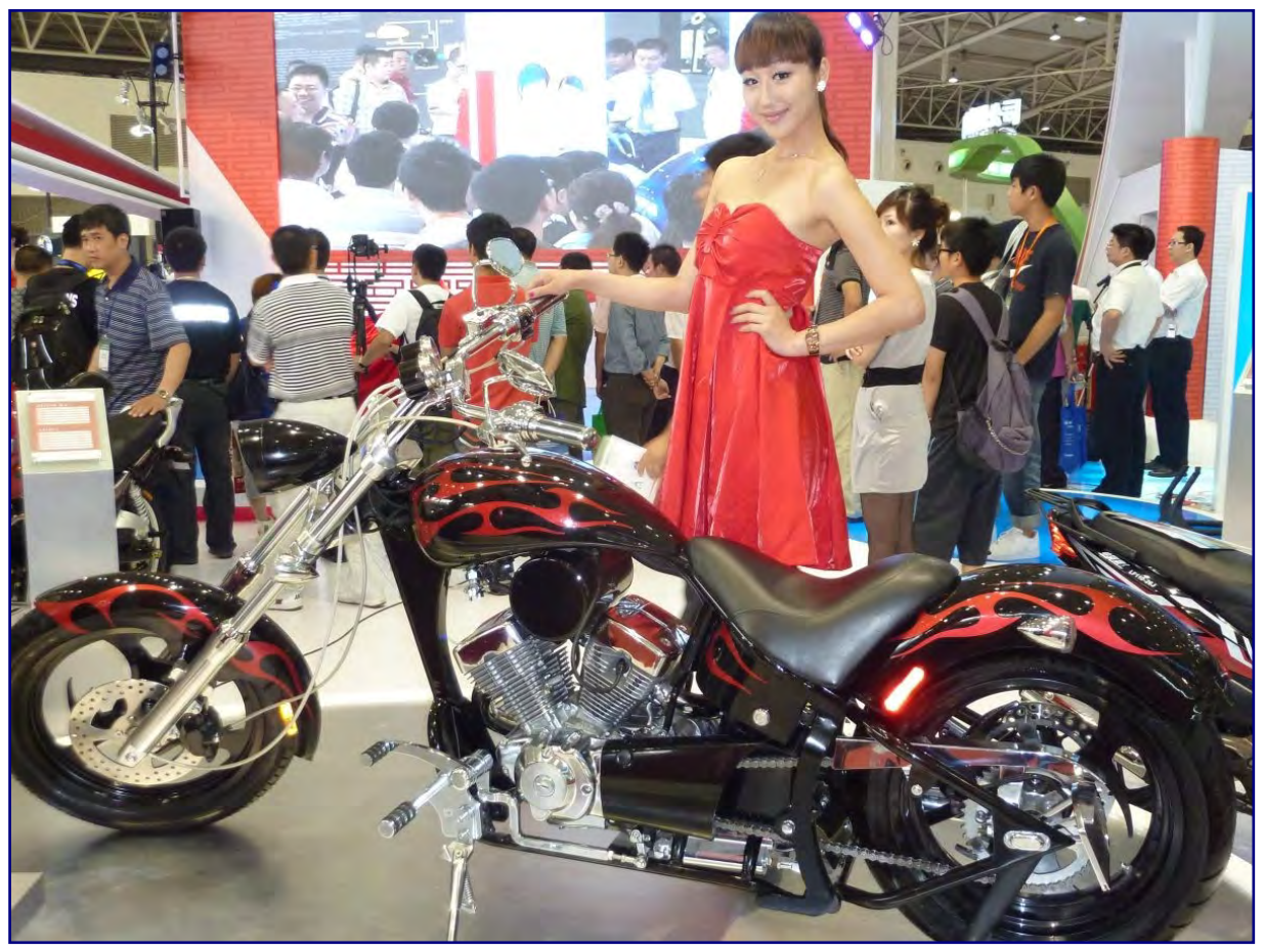
A lot of resemblance to Honda's 1300 Fury here, and that engine looks familiar too.

To sum up, from the German and wider European patent law point of view, a manufacturer cannot protect a normal engine. Protecting a design is possible, but enforcement is difficult and can take years. Manufacturers are in the best position against Chinese plagiarists when they adapt or use an original logo, protected as a trademark. That makes it clear why the 500 cc Honda engine is copied so often.