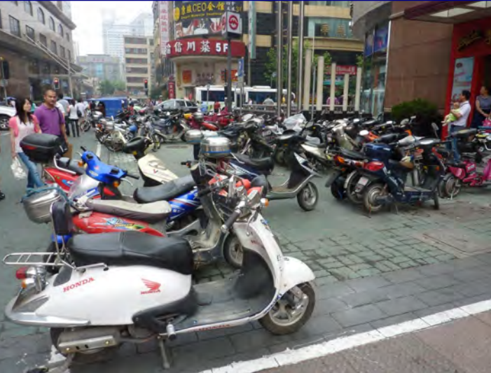
The only thing "Honda" on this scooter is the stickers. Likewise for Suzuki.

A new design for a motorcycle can in principle be registered for protection, but it must not already exist in one way or another. And it must – like a patent – have individual character, a unique selling point. The overall impression of the design must differ from the existing design. However, delineating when a new design infringes a protected design is difficult and can take a long, as I explained on this site in the case of Piaggio vs. German scooter manufacturer Kumpan. Piaggio lost that one, despite throwing all its legal expertise at it. And anyway, the maximum time protection lasts is 25 years.