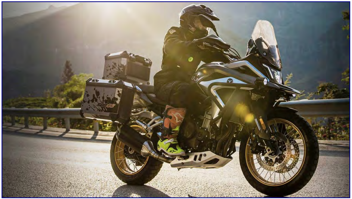
Rolls like a GS, quacks like a GS... so it's a GS. But not like we know it, Jim.

Intellectual property is all very well, but only if you can protect it by The Bear