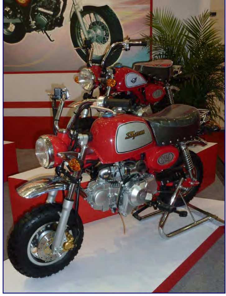
Hey hey, it's a Monkey... except it isn't.

Advice from the specialists of the German