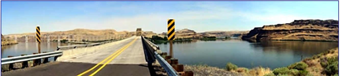
The Lyons Ferry Bridge on SR 261

Have you enjoyed the adrenaline high of the Starbuck Highway? Experienced the pleasure of the overlook at Palouse Falls or dug into the twisties near Dusty?