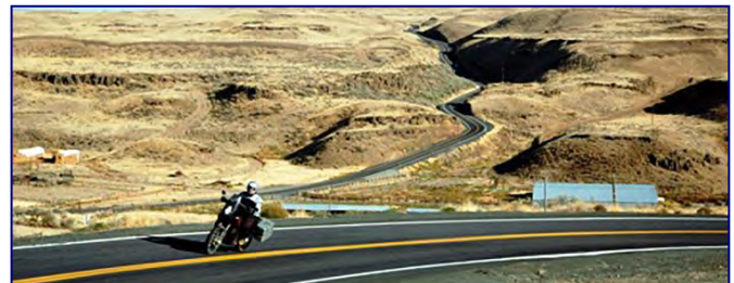
Enjoying the Starbuck Highway

Are you a WSU fan? Plan to make a field trip out of it and grab a game during your stay. Then spend Sunday exploring the back roads and getting back home.