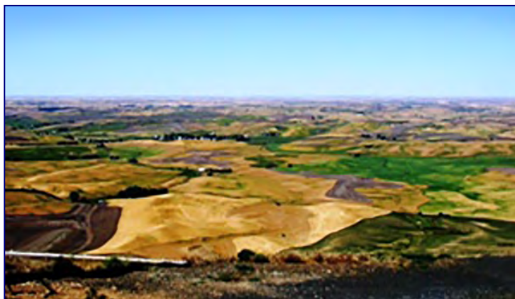
The view from Steptoe Butte

There are numerous dam crossings over the Snake River, many with roads, but don't expect them to be open when you get there. Despite what old information abounds, the Army Corp of Engineers recently began allowing traffic across some and that is when they are at work – take that to mean Monday through Friday. Do your homework online ahead of time so you don't bump into a locked gate.