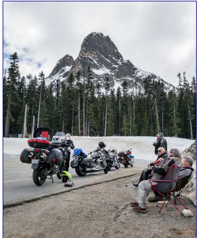
May 15, 2020 - North Cascade Highway opening. Lunch at Washington Pass.