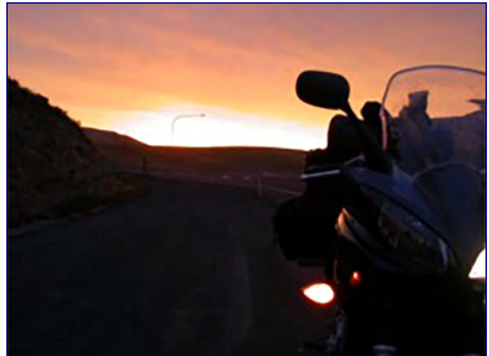
Sunsets can be stunning in the Palouse during the early fall months.

Boomerang aficionado? Didn't think so, but a trip to the Boomerang Museum in the town of Palouse can be sweetened with a nearby coffee drink and giant cookie from the gift shop in town.